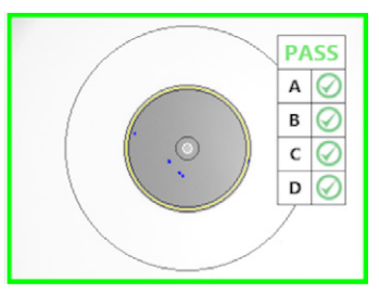
The OLTS-85 gives you the answer: