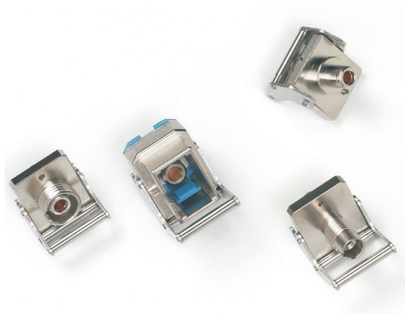
Optical adapters (BN 2150) for laser source output